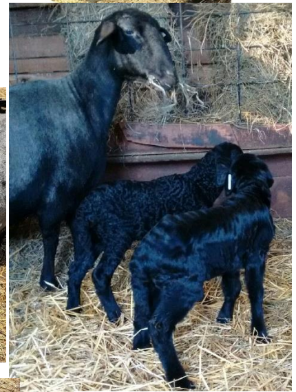
Polly with twins Jan 2018 – Prince (curls) & Plato (moiré)