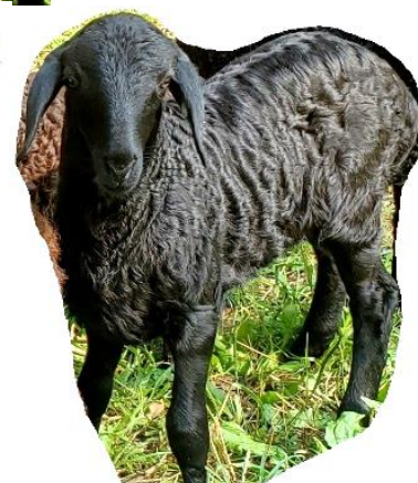
Archy at 3 weeks